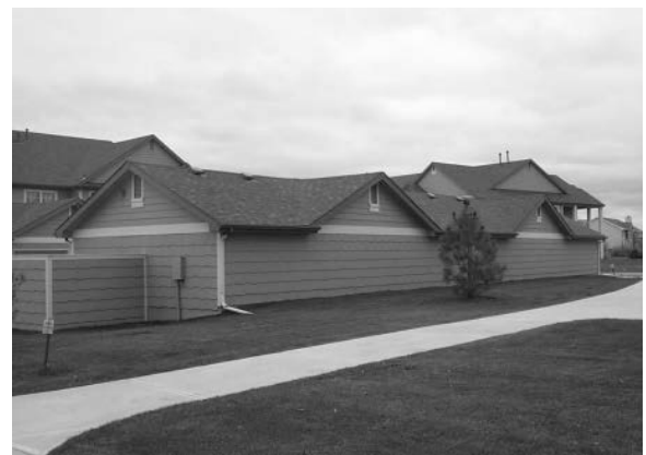
Figure 10-6 – Multi Family Garages