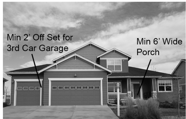
Figure 10-5 – Third Car Garage