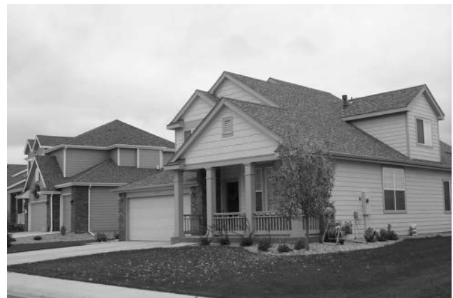
Figure 10-4 - Garage Recessed Behind Front Porch