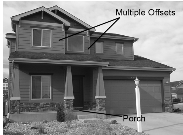
Figure 10-1 – Front Facade

Home or Building entries may be formal and elevated (porches) or low and understated.