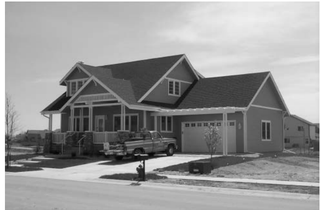
Figure 10-3 - Garage Recessed Behind the Front Facade