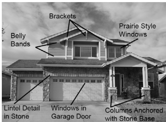
Figure 10-7 – Architectural Elements