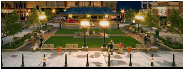
Figure 16.7g – Village Greens