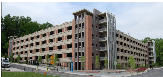
Figure 16.11c – Parking Structures: Enhanced corner stair tower and/or corner elements. Balanced pattern of horizontal and vertical panels.