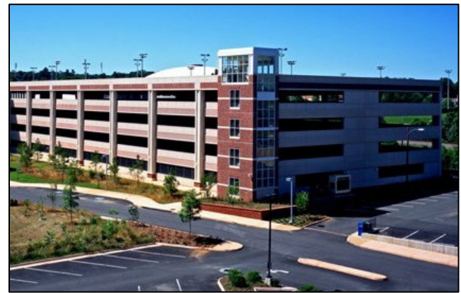
Figure 16.11d – Parking Structures: Vertical column façade approach.