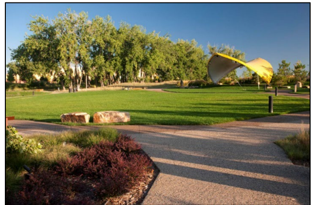
Figure 16.7j – Park Lawns