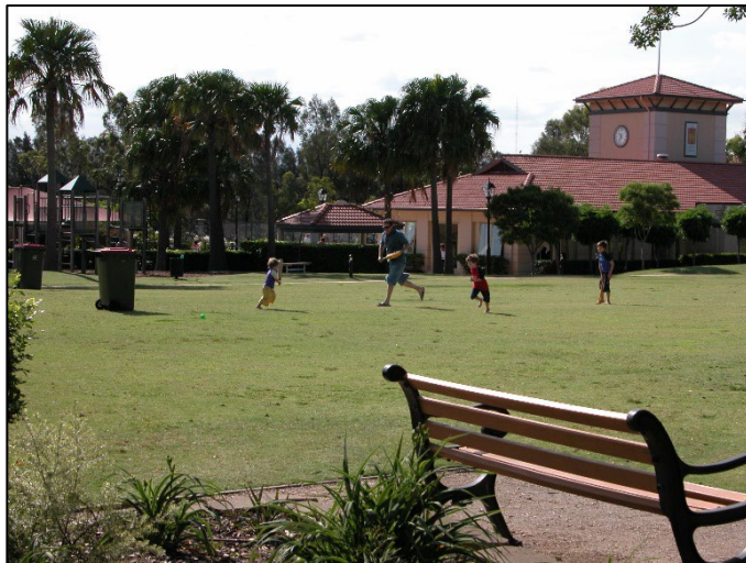
Figure 16.7h – Park Lawns