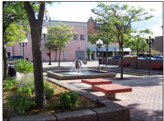
Figure 16.7a Plazas