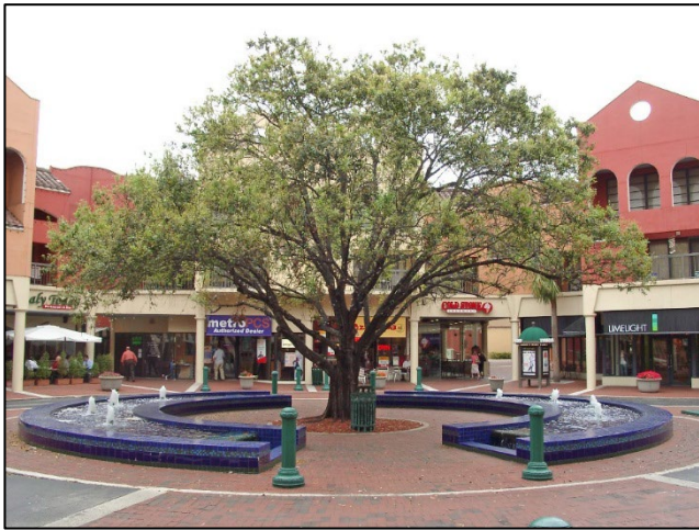
Figure 16.7b Plazas