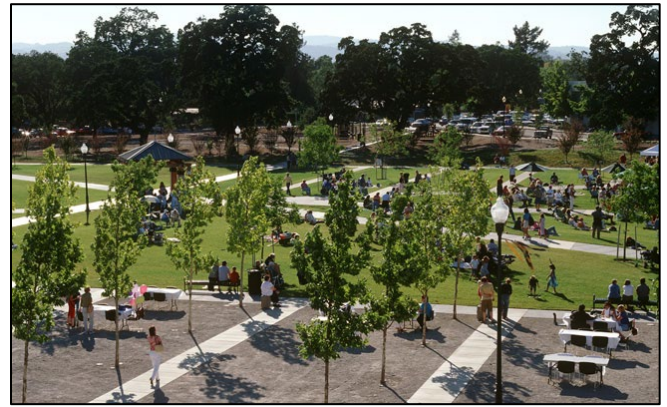
Figure 16.7d – Village Greens

A village green is an accessible Shared Common Area that uses a combination of paved areas, landscaped areas and turf. Specialty pavement is encouraged. Village greens are ideal gathering spaces for large or medium sized groups with moderate to high intensity activities. Village Greens shall be a minimum of one half acre in size unless otherwise approved by the DRC and the City. (See Figures 16.7 d-g).