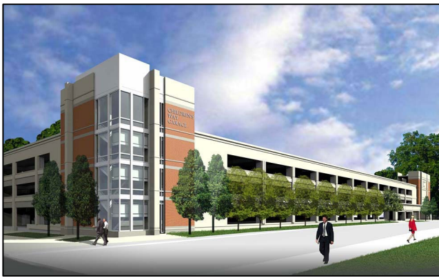
Figure 16.11a - Parking Structures: Where possible, screen with canopy and/or evergreen trees.