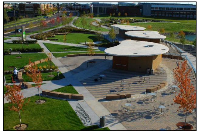
Figure 16.7e – Village Greens