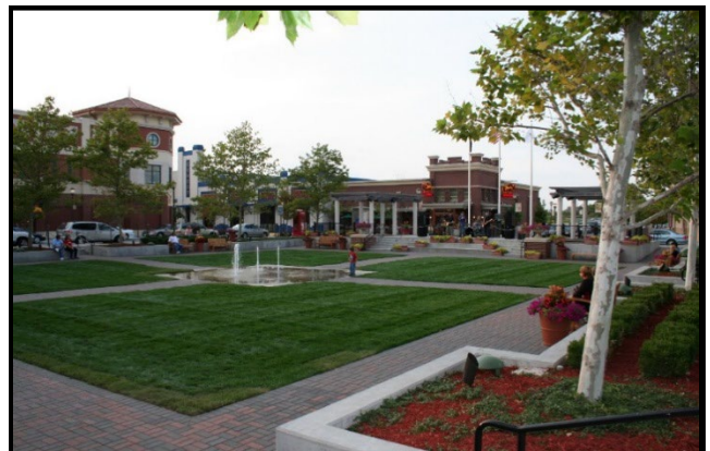
Figure 16.7f – Village Greens