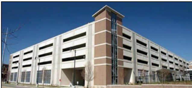
Figure 16.11b – Parking Structures: Simple, clean lines with a horizontal dominant design.