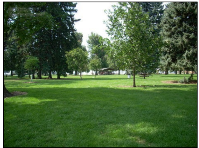
Figure 16.7i – Park Lawns