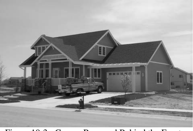
Figure 10-3 - Garage Recessed Behind the Front Facade