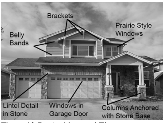
Figure 10-7 – Architectural Elements