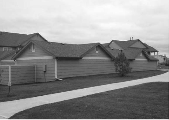
Figure 10-6 - Multi Family Garages