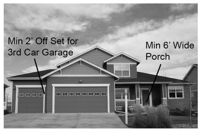
Figure 10-5 – Third Car Garage

c) A garage door may extend forward of either the living portion of the house or the front of a covered porch a maximum of 4' provided the front elevation of the house includes a front porch that is a minimum of 6' wide (See Figure 10-5).