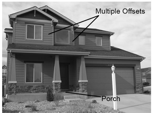
Figure 10-1 – Front Facade

Home or Building entries may be formal and elevated (porches) or low and understated.