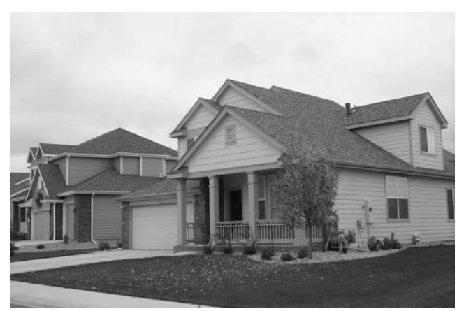
Figure 10-4 - Garage Recessed Behind Front Porch

c) A garage door may extend forward of either the living portion of the house or the front of a covered porch a maximum of 4' provided the front elevation of the house includes a front porch that is a minimum of 6' wide (See Figure 10-5).