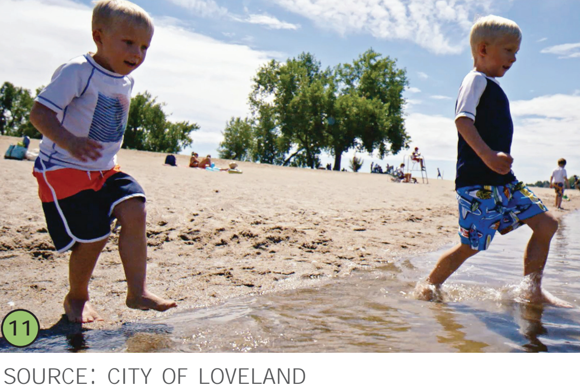
11 SOURCE: CITY OF LOVELAND