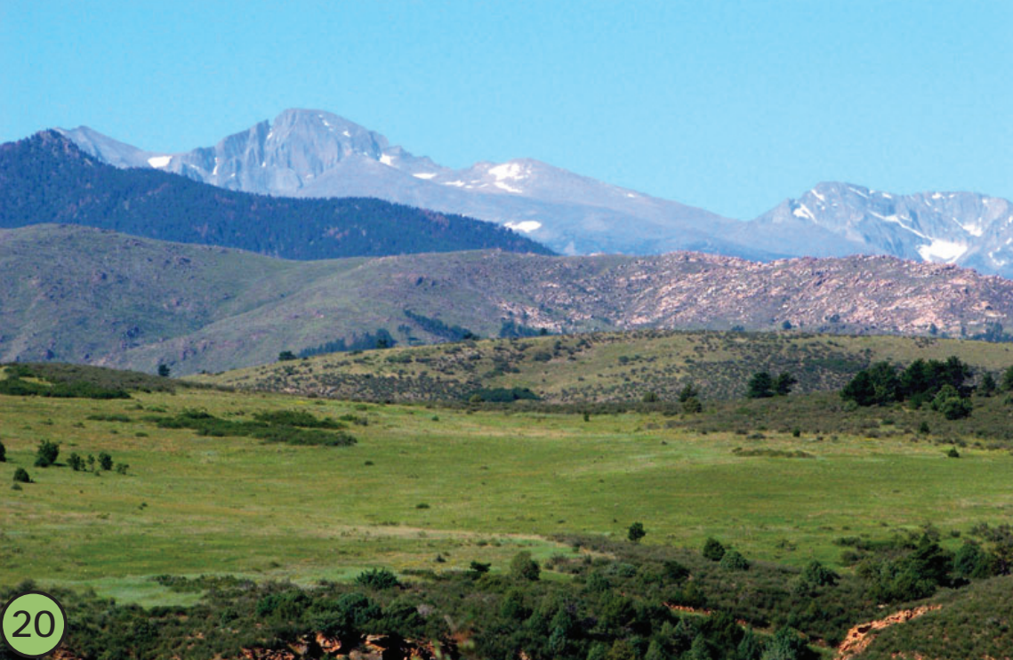
20 SOURCE: LARIMER COUNTY

CENTERRA REGIONAL TRAIL CONNECTIONS APRIL 29, 2019